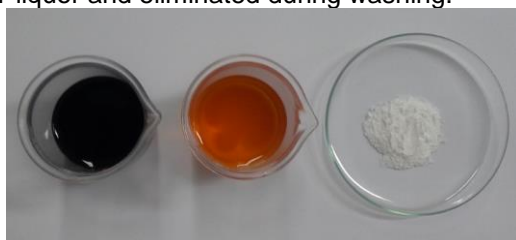
Figure 2. The mining residue, the mother-liquor of the reaction and the zeolite obtained, from left to right.

The preparation of these materials followed the standard protocol for zeolites syntheses. To a silicate solution, the industrial residue rich in aluminum was added. The mixture was then homogenized and the reaction gel was brought to the hydrothermal treatment. The residue used is very dark in color. Even so, after washing and drying, the zeolites obtained were presented as bright white powders while the mother-liquor was dark tanned, as shown in Figure 2. This is a strong indication that the impurities present in the residue were transferred to the mother-liquor and eliminated during washing.