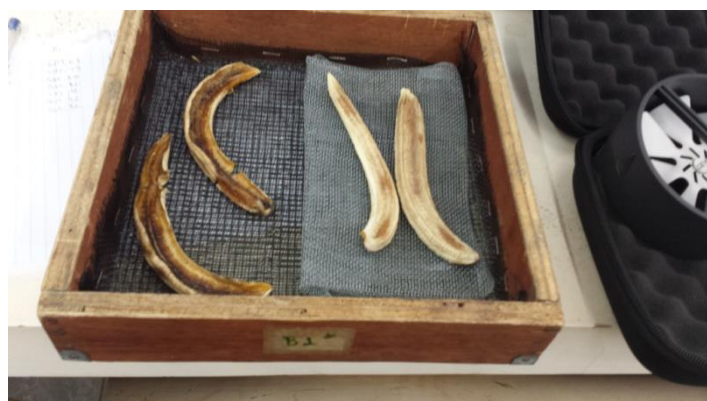
Figure 1. Bananas cut into longitudinal slices arranged in the tray of column dryer

Lastly was held rotary drying columns, where the sliced bananas as described in the previous procedure, were arranged vertically following the sequence from bottom to top in one column and reversing this sequence in the other. A temperature of 65 ° C was used. The samples were identified by A1, A2, A3, B1, B2, B3 .