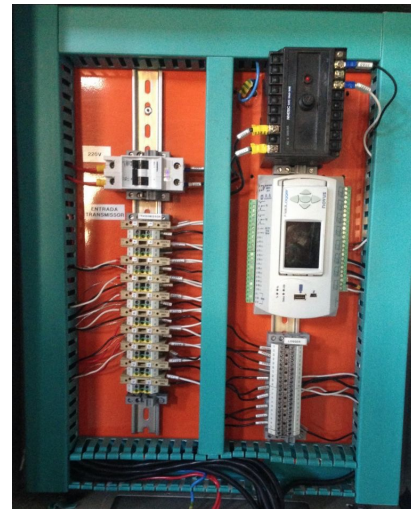
Figure 2. Connection panel.

configured as input or output. The configuration software allows collection and export of log data and status information. To unite all these functions and instruments, we have enhanced a connection panel in this work (Figure 2). It consists of a circuit breaker, a transformer, a transmitter with 10 channels and the logger. Pressure transmitters are all powered by this circuit. The flowmeter is connected to the power grid of the laboratory and connected to the FieldLogger