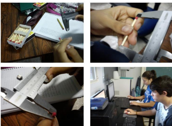
Figure 1: Measurement of matchsticks in the Concrete Mathematics Lab.

The students researched about SPC, control charts, calipers, and measurement techniques, aiming to compose a written material about those subjects. They measured the thickness and the length of 480 matchsticks with vernier calipers and recorded the data in electronic sheets (Fig. 1).