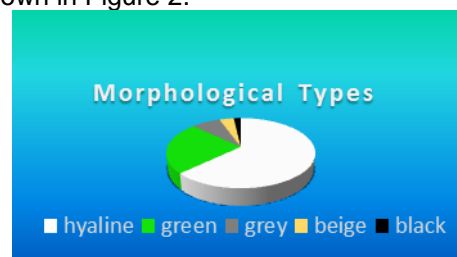
Figure 2. Distribution of morphological types.

Results and Discussion: In total, 65 fungi were isolated from the passion-fruit leaves distributed in 7 yeasts and 58 filamentous fungi. Main genera found were Aspergillus , Penicillium , Phoma and Cladosporium . Different morphological types are shown in Figure 2.