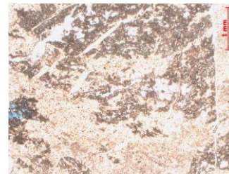
Figure 2. Evidence of Microbial Mats Arborescent.