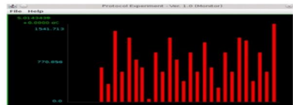
Fig. 3: Server monitoring one single sensor.

The server side simultaneously monitors the activity of a set of sensors. Figure 3 presents the server running with a single sensor connected to itself.